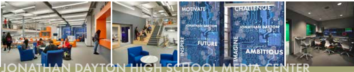
JONATHAN DAYTON HIGH SCHOOL MEDIA CENTER