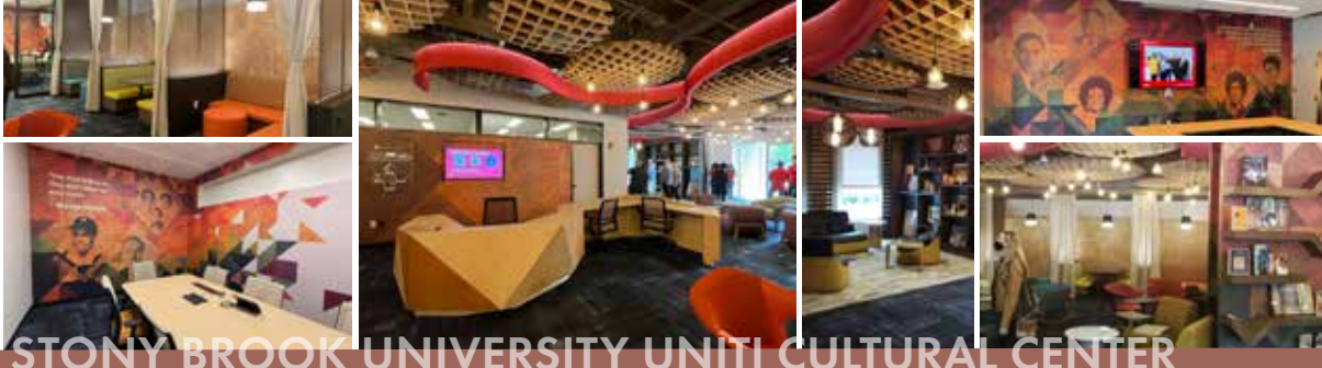
STONY BROOK UNIVERSITY UNITI CULTURAL CENTER