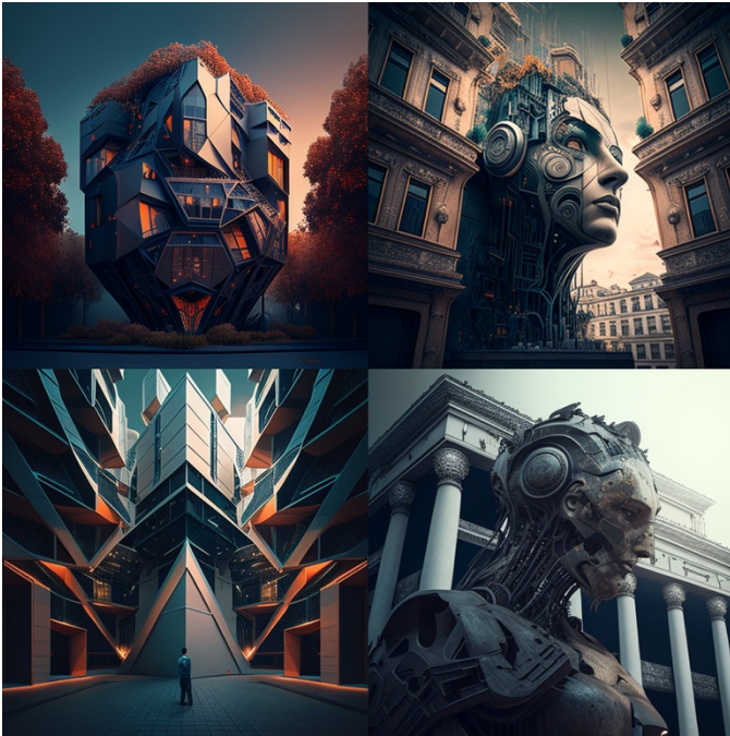
/imagine [prompt:] architecture and artificial intelligence (first iteration)

On a vacant site in downtown Jersey City you will design a 9-10 story hotel with some publicly accessible programmatic components. We will begin by examining precedents that are typically referred to as "boutique" or "designer" hotels, i.e., hotels that aim to avoid the banality of convention and that strive for a certain look, character, or esthetic "edge". We will then ask the following questions: What does it mean to be a tourist or a business traveler in downtown Jersey City? What would they need in an urban hotel, what would they expect, what would they desire? Is it comfort and "domesticity" or is it something else? What would make your hotel unforgettable? What is the relationship of space and memory? What do we remember about spaces where we stay, the cities that we visit?