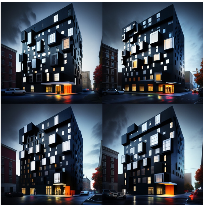
/imagine [prompt:] a contemporary hotel in newark (third iteration)